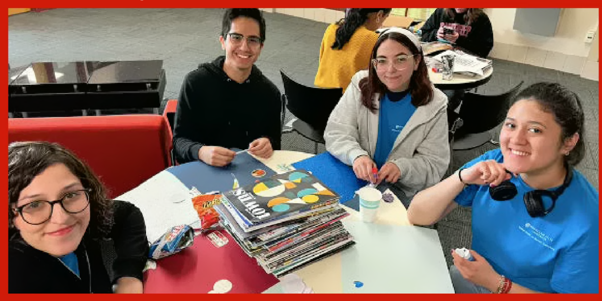
Photo: GCHT Interns and Student Ambassadors hosting end-of-year safe space event.