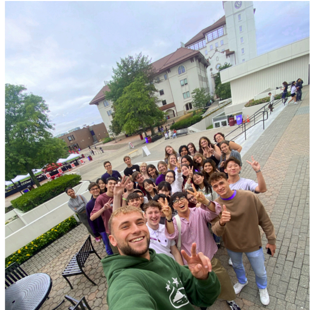
Fall 2024 Inbound Exchange Students at their Inbound Orientation on Campus with the Office of International Academic Initiatives (IAI).