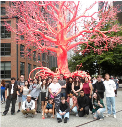
Fall 2024 Inbound Exchange Students visit the Chelsea High Line and connect with Study Abroad Peer Advisors who have participated in a study abroad programs while attending Montclair State University.