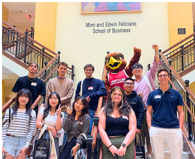
Fall 2024 Business Exchange Students and Rocky, Montclair's mascot, at the Feliciano School of Business

Fall courses are published in late March for April registration. Spring courses are published in late October for November registration. Be mindful of prerequisites and note that even though every department is open to exchange/visiting enrollment, some courses have limitations.