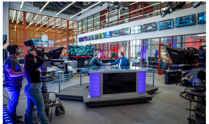
News Lab: the headquarters of Montclair's journalism and digital media programs, where students get hands-on training in media and news production.