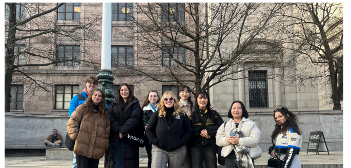
Inbound Exchange students and IAI staff enjoying the Museum of Natural History in Spring 2024 as a part of their Inbound Exchange Orientation.

Our mandatory orientation provides essential information about your J-1 visa, campus organizations/activities, academic requirements, adjusting to life in the US, and several other topics. It provides a great opportunity for you to meet other exchange or visiting students. Weather pending, we also plan an excursion into New York City to learn how to navigate local culture and transportation.