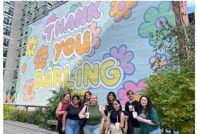
Fall 2024 Inbound Exchange Students enjoy Horchata with IAI Staff and Study Abroad Peer Advisors on a Chelsea High Line excursion in September 2024.

We will make every effort to secure you a spot in all courses requested, but please understand that due to retiring professors, curriculum adjustments, pre-requisites, and some full courses, not all requests can be met.