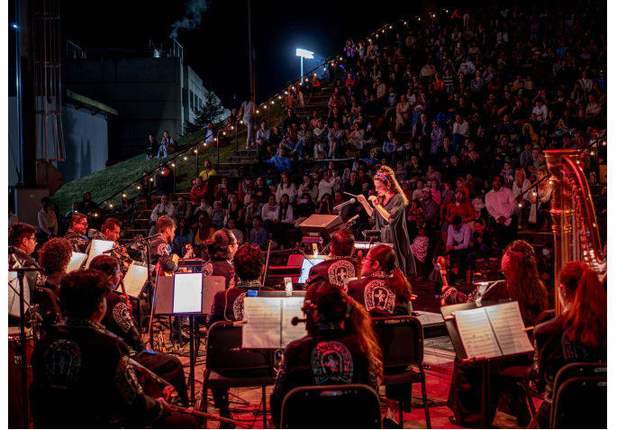
Fall 2023 Performance of Disney and Pixar's Coco with live music performed by Orquesta Folclórica Nacional de México in Montclair's amphitheatre.

Students will be automatically enrolled in and billed for the student health insurance for the duration of their program.