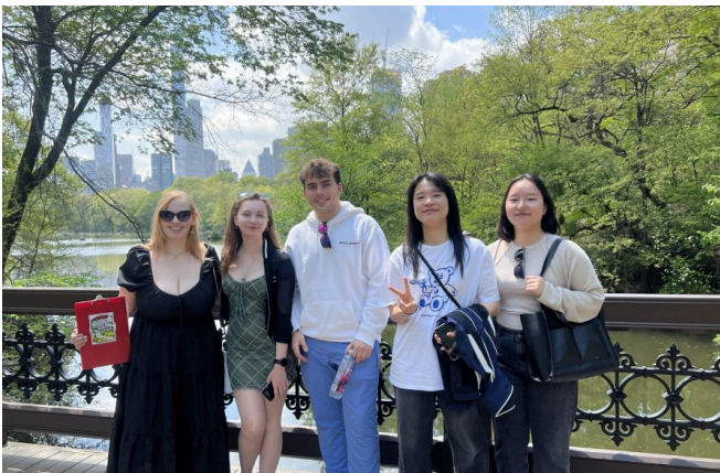
Spring 2024 Inbound Exchange Students enjoy an end of year excursion to Central Park with IAI staff.