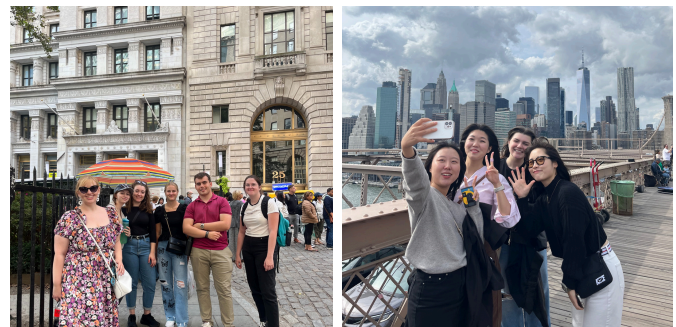
Fall 2023 exchange students with IAI staff on tours of the Brooklyn Bridge, World Trade Center, and Wall Street.

Students living on campus will be required to move out of campus housing by 11am on the day after the official semester ends. The J-1 visa allows a 30 day grace period after the last scheduled day of the exam period. International students must depart the US within those 30 days. Extended stays in campus housing must be discussed and approved by Residence Life.