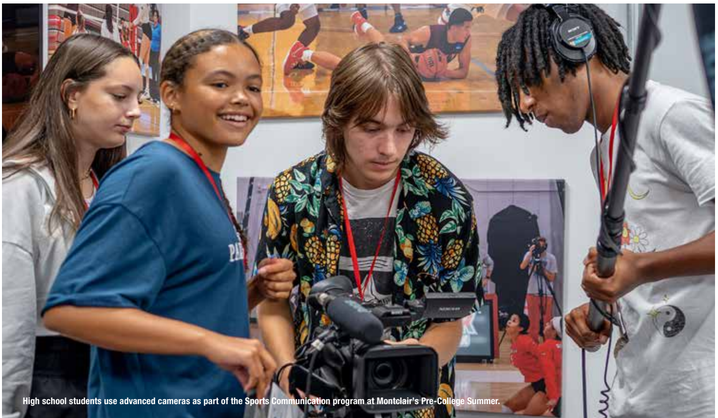
High school students use advanced cameras as part of the Sports Communication program at Montclair's Pre-College Summer.

Learn more at montclair.edu/pre-college .