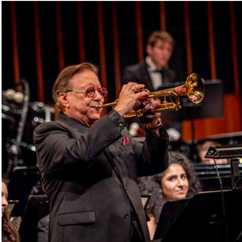
Trumpet master Arturo Sandoval plays with the University Wind Symphony at Alexander Kasser Theater as part of the Cali Immersive Residency Program.

Being just 12 miles from New York City, one of the largest and most exciting metropolitan areas in the world, means boundless opportunities. The College of the Arts draws on its extensive networks to invite world-class guest artists, including Grammy winners, to provide lectures, interviews, master classes and performances.